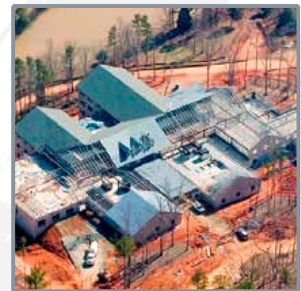
American Institute for Healthcare and Fitness Raleigh, NC