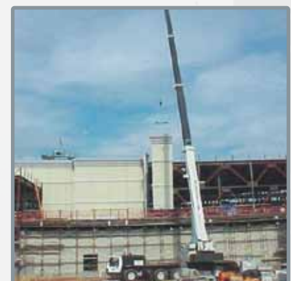
North Hills Shopping Center Raleigh, NC