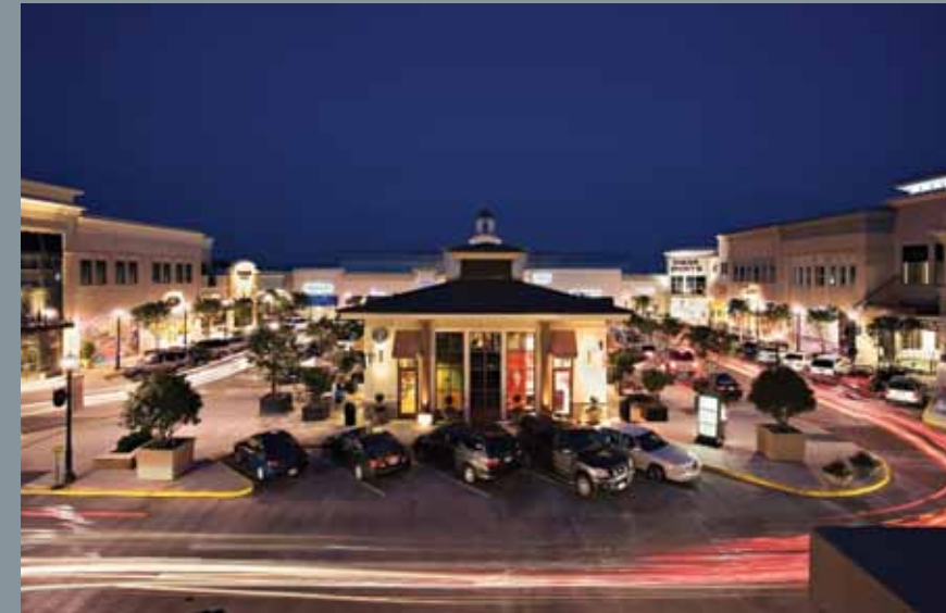
North Hills Shopping Center, Raleigh, NC

Advanced Exterior Systems (AES) is your source for exterior wall and truss solutions. Serving the commercial and industrial building industry in the Southeast since 1977, AES designs, engineers and fabricates in our 70,000-square-foot facility.