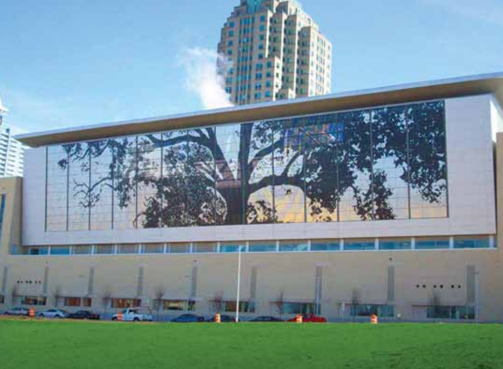
Shimmer Wall with Aluminum Composite Panels/Raleigh Convention Center, Raleigh, NC

Advanced Exterior Systems (AES) is your source for exterior wall and truss solutions. Serving the commercial and industrial building industry in the Southeast since 1977, AES designs, engineers and fabricates in our 70,000-square-foot facility.