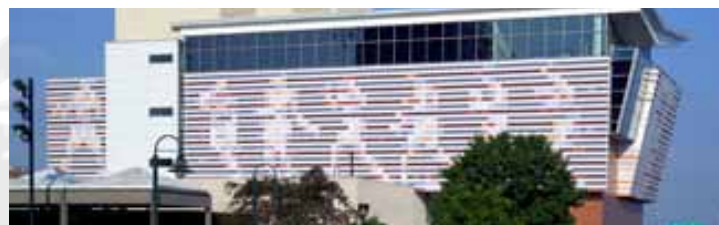
Muhammad Ali Center, Louisville, KY